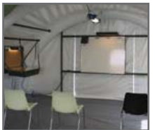
Map Board/ Field Desk