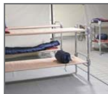
ROFI Disco bed