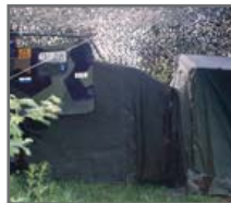
Connectors to vehicle