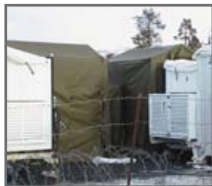
Connectors to container