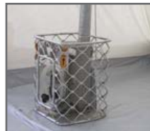
ROFI Volcano sauna