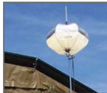
ROFI Camp light