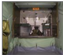
Connectors to vehicle