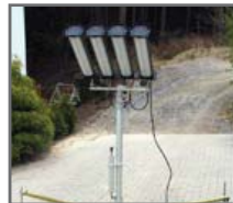
ROFI Camp light