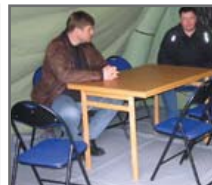
ROFI Folding chair/table