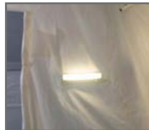
ROFI Cabin light