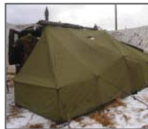
Connectors to vehicle