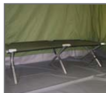
ROFI Field bed